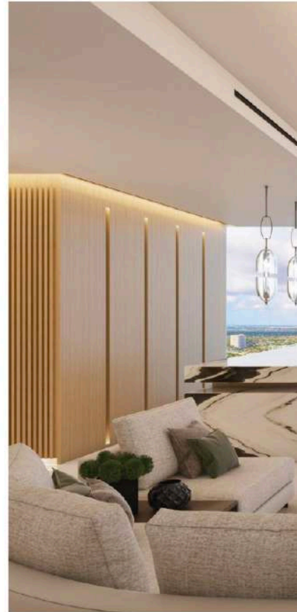
Left, from top: Hallock Design Group's contemporary living space; B+G Design reflects the outdoors in its design.