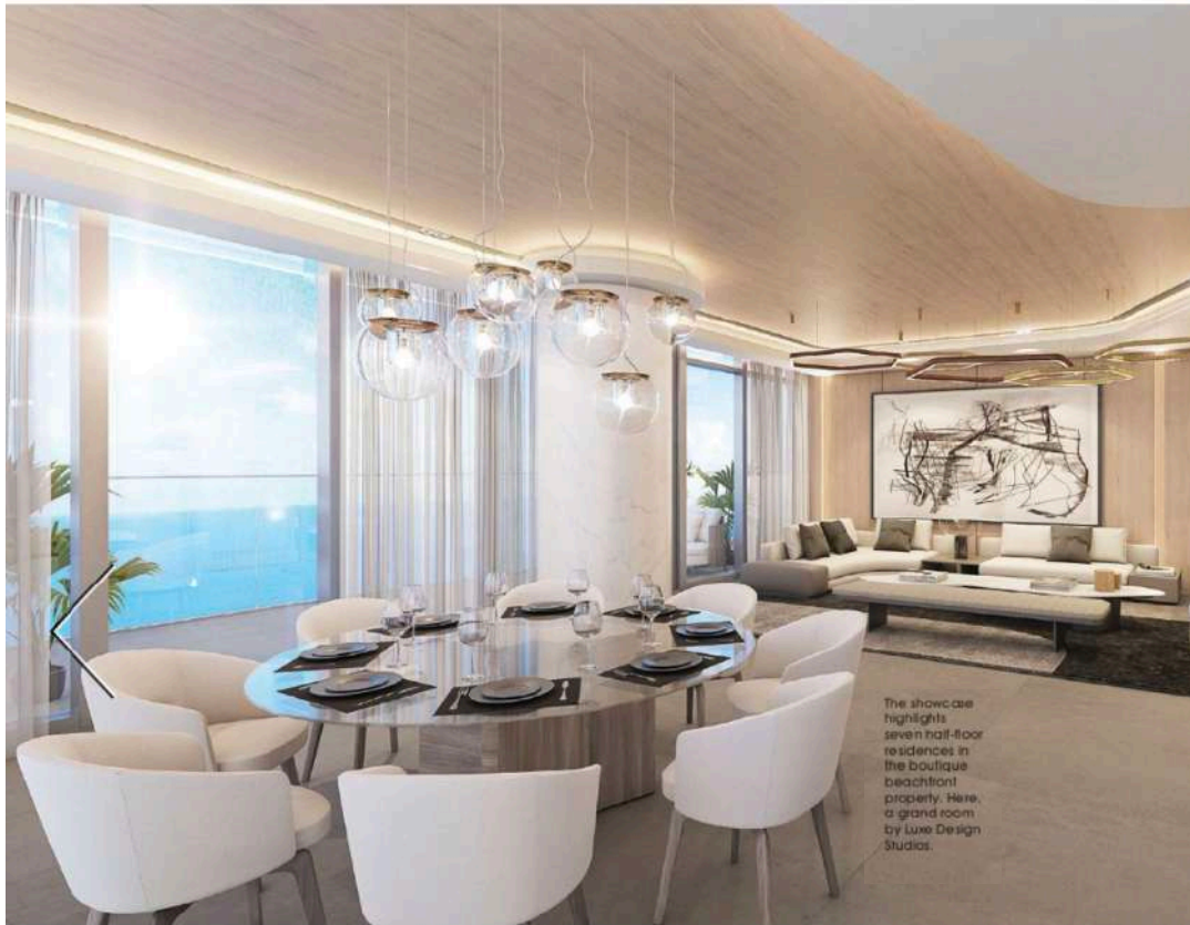
The showcase highlights seven half-floor residences in the boutique beachfront property. Here, a grand room by Luxe Design Studios.