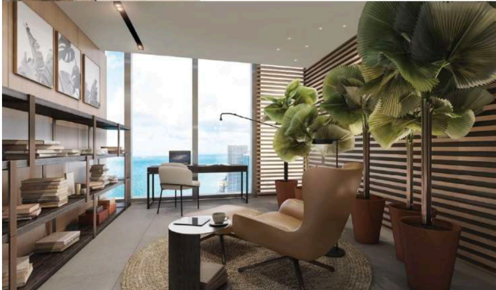
From top: A palette of grays and statement artwork in a bedroom by Pepe Calderin Design; Atelier de Yarovskiy brings natural elements into an office space.