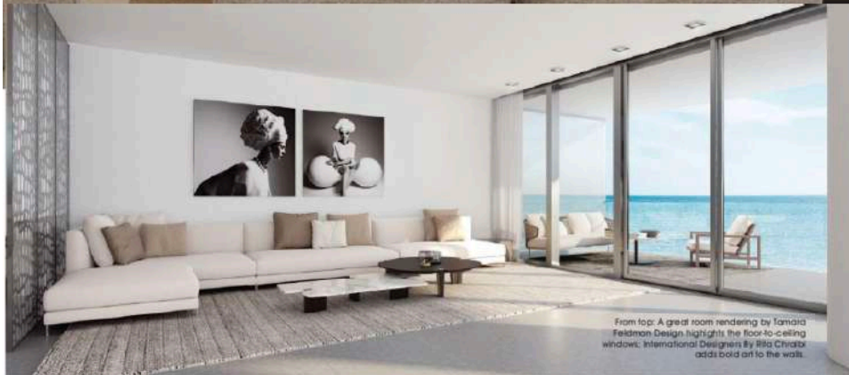
From top: A great room rendering by Tamara Feldman Design highlights the floor-to-ceiling windows. International Designers By R99 Creative adds bold art to the walls.