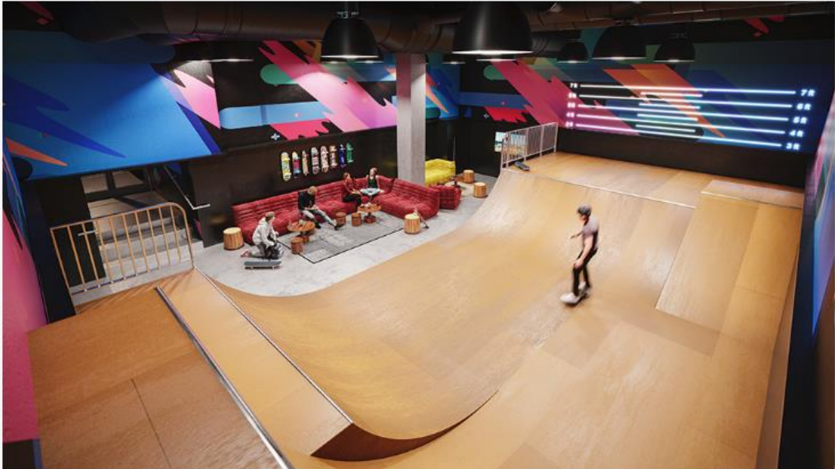
The indoor skate ramps at Waterline Square in Manhattan.

For the kid (or kid at heart), Waterline Square's 100,000-square-foot amenity space—in one of Manhattan's top neighborhoods—is an adrenalin-fueled godsend. It includes a halfpipe and mini ramp, alongside a 30-foot rock climbing wall and indoor soccer field. The three-building complex was designed with offerings for just about every interest and age group, creating one of the premier family-focused residential buildings on the Upper West Side. Pricing begins at $1.825 million for a one-bedroom condo and continues upward to penthouses starting at $17.25 million.