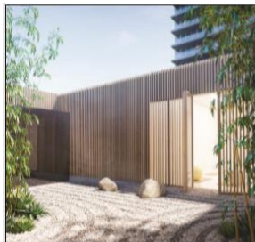
An enclosed courtyard at 2000 Ocean will have the look of a Zen garden.