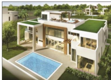
Veridan Grove will have a 65-foot lap pool for those who want to do some serious swimming.