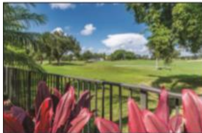
Residents can enjoy views of the Weston Hills Country Club golf course.