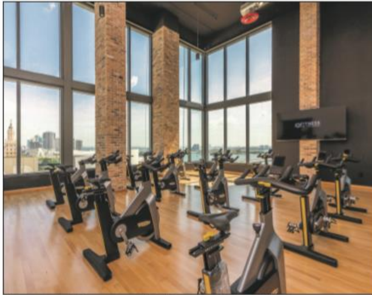
Having a great view at the fitness center may make it a bit easier to exercise.

Being able to maintain a healthier lifestyle without leaving home can be appealing to busy people. "Today's buyers particularly want privacy and amenities that are geared toward health, wellness and activity,