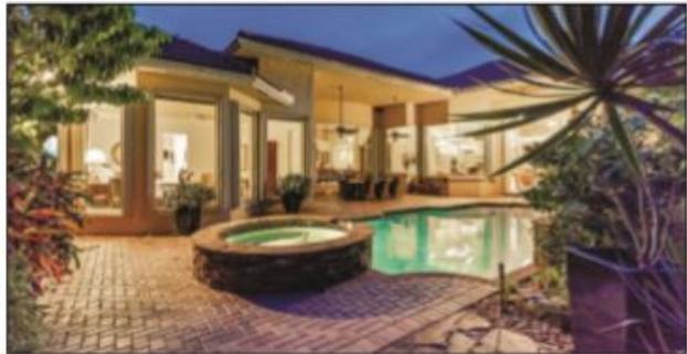
The property has more than $100,000 in upgraded landscaping and a rebuilt pool and spa area.

For more information, contact Phyllis Scarberry at 954-980-3385.