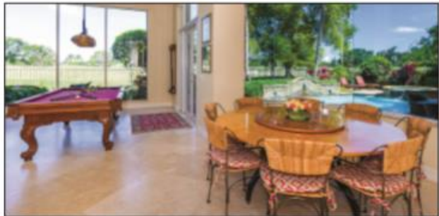
The home has views from nearly every room, an attribute enhanced by expansive impact glass windows.