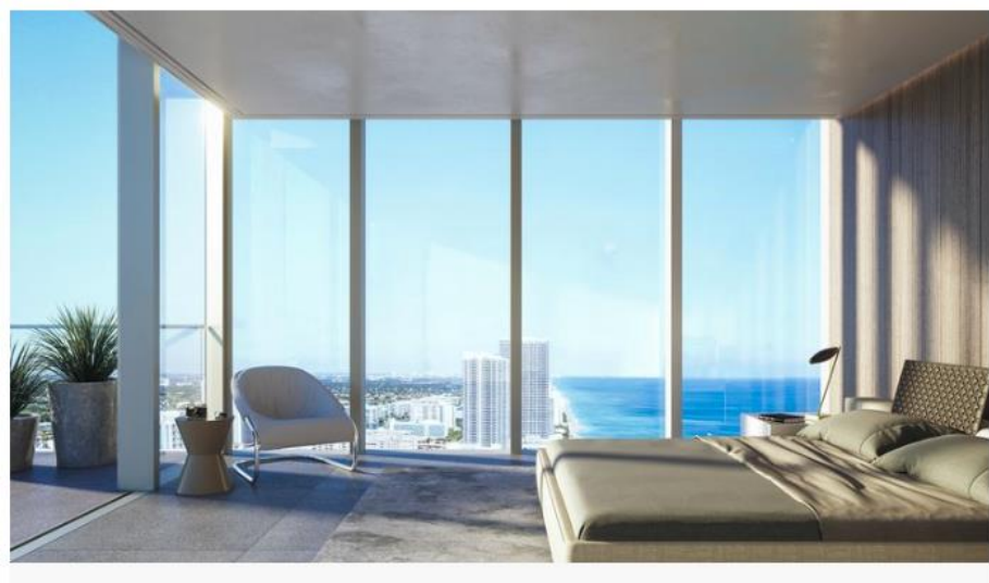
A rendering of a master bedroom furnished by Minotti at 2000 Ocean.

developer of the boutique property 2000 Ocean—luxury means more than just a high-rise plopped down on a private beach. For him, it is a combination of factors, most notably: design, function, execution—and Minotti furnishings, of course.