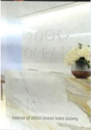
Interior of 2000 Ocean Sales Gallery