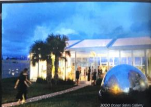
2000 Ocean Sales Gallery